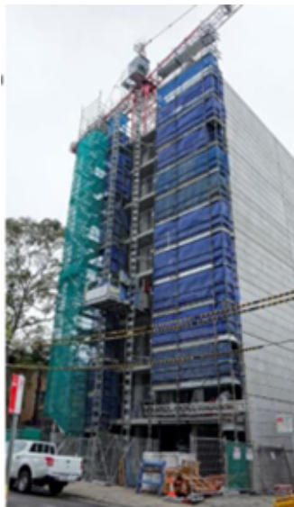
Example 3: Not Acceptable in Commercial Zones