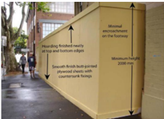
Example 5: Painted - Acceptable in Commercial Zones