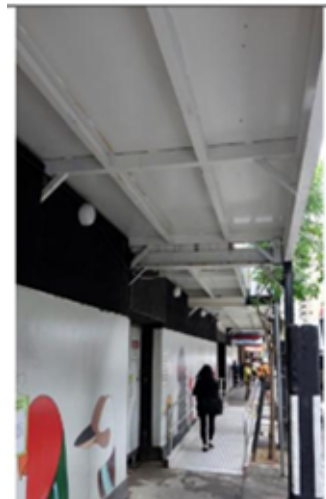
Example 14: Underside of hoarding must be painted white