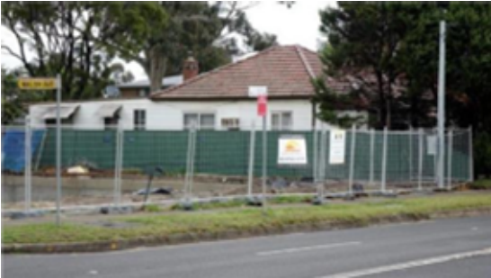
Example 1: Acceptable in Residential Zones only