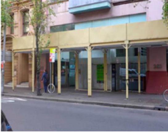
Example 11: Gantry Style – Acceptable in all zones