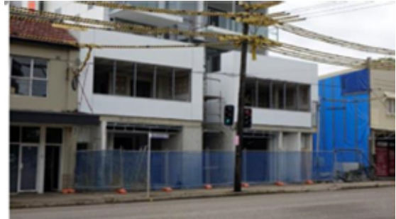
Example 2: Not Acceptable in Commercial Zones