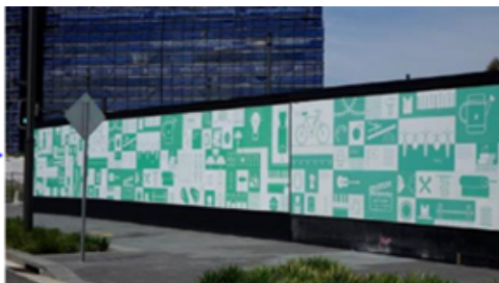
Example 9: Graphic Display – Acceptable in all zones; Mandatory in Commercial Zones