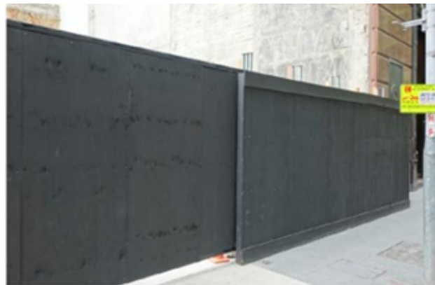
Example 6: Painted - Acceptable in Commercial Zones