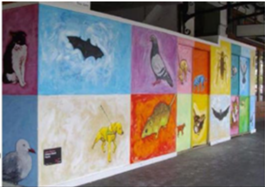
Example 7: Graphic display – Acceptable in all zones; Mandatory in Commercial Zones