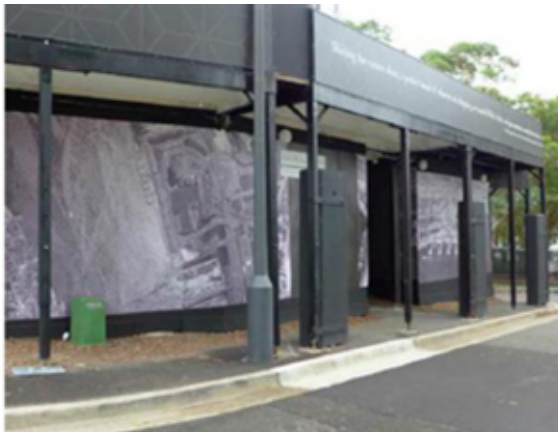
Example 13: Gantry Style – Acceptable in all zones