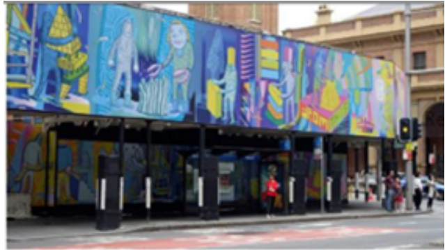
Example 12: Extended fascia to screen overhead sheds – Acceptable