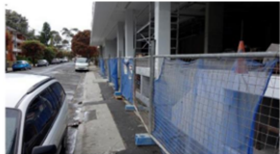
Example 4: Not Acceptable in Commercial Zones