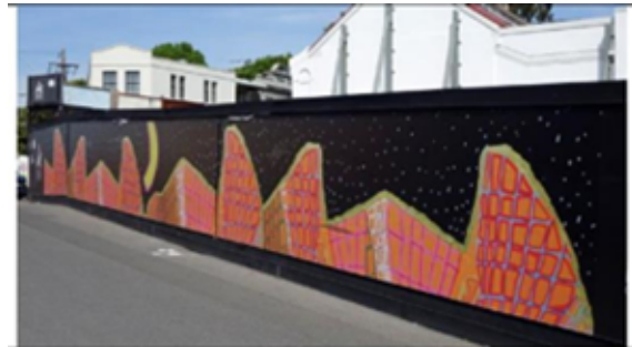
Example 10: Graphic Display – Acceptable in all zones; Mandatory in Commercial Zones