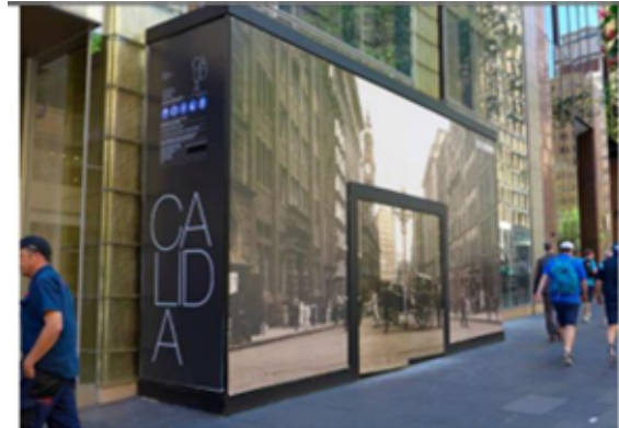
Example 8: Graphic display – Acceptable in all zones; Mandatory in Commercial Zones