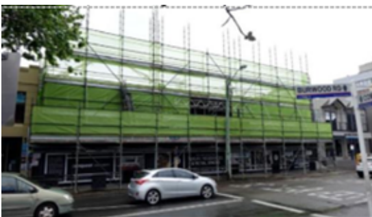
Example 15: Scaffolding Style – Not Acceptable in any zones