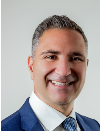
Cr John Faker Mayor of Burwood

The current Council was elected in September 2017.