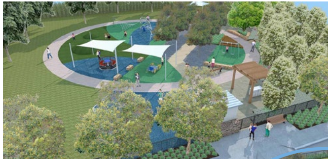
Grant Park artists impressions