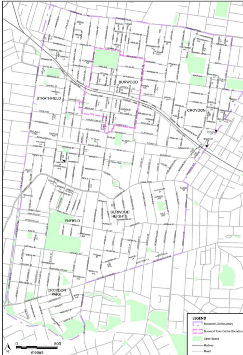
Figure 1 – The Burwood LGA and the Burwood Town Centre

This Plan applies to all land within the Burwood LGA as shown on the map in Figure 1.